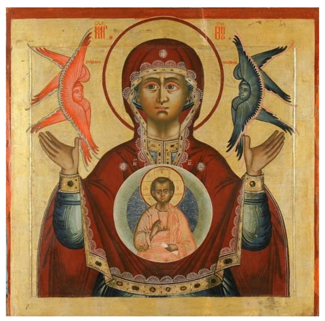
"Our Lady of the Sign", 18th Century Iconostasis, Kizhi Monastery, Russia