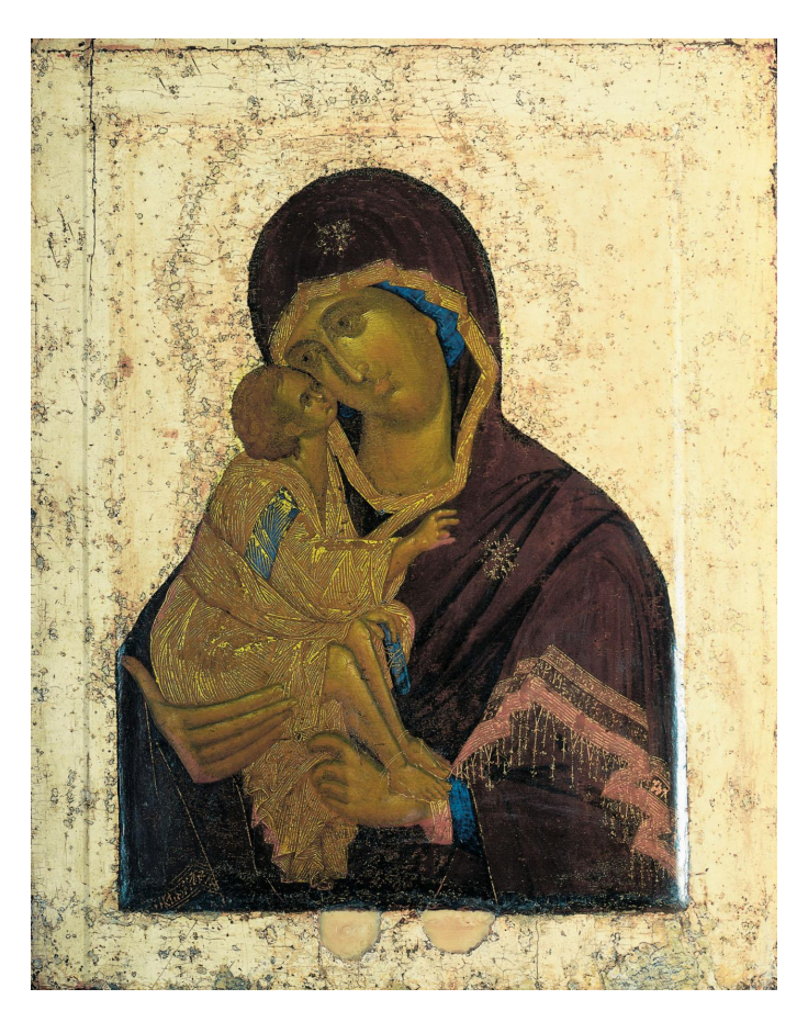
"Our Lady of the Don", 14th C., Donskoy Monastery